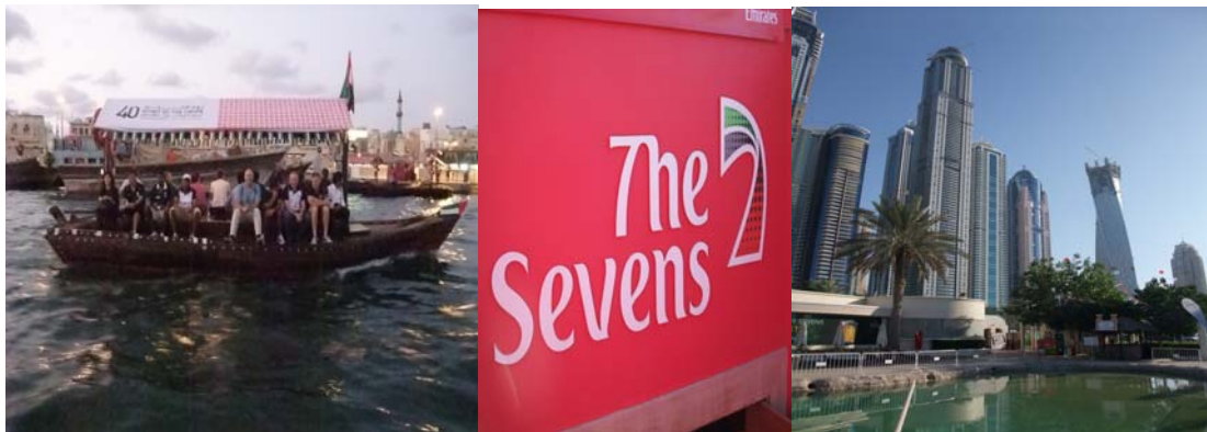
The Dubai Creek water taxi & a typical skyline architectural view of modern Dubai...